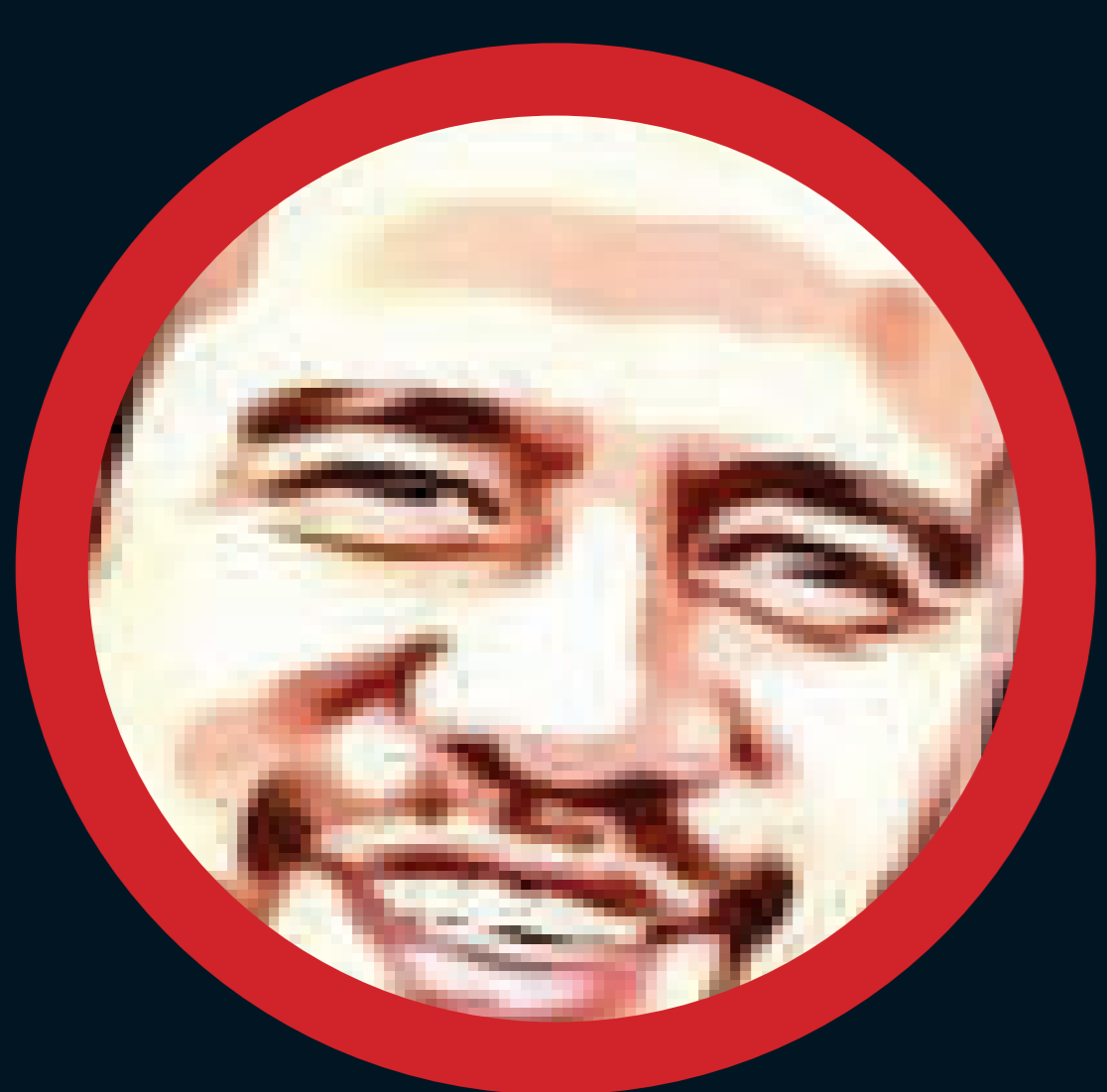
Che's Channel Te Paepae Waho

Tiakina ngā tamariki Look out for the children